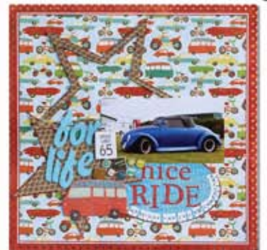
Double Star Template for "Nice Ride for Life"